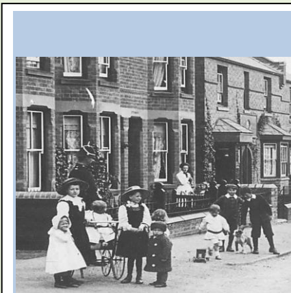
A policeman surrounded by children in Cubbington Road. Early 1900s